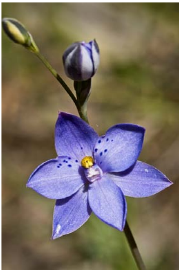
Spotted Sun Orchid

Choosing a sunny day recently with little wind I explored the area just east of the dam and came across large numbers of Waxlips Glossodia major and Golden Moths Diuris chryseopsis . Rabbit Ears Thelymitra antennifera occurred in groups scattered around the area and with one group I also found three Crimson Sun Orchids Thelymitra macmillanii . Just coming out were some Spotted Sun Orchids Thelymitra ixioides , and more will emerge in the next week if it remains sunny. One or two specimens of the Mantis Orchid Caladenia tentaculata were seen. Other flowers included Blue Squill and Yam Daisy.