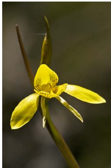
Golden Moth Orchid

The sunny weather enabled me to use small apertures to obtain sufficient depth of field with my macro lens but the bright light resulted in highlights which could have been prevented had I used a diffuser of some sort- but there are limits as to how much equipment I want to carry around! It was lovely to enjoy the ambience of the bush, no-one else around and with quite a variety of birds calling, including White-winged Choughs, Superb Fairy Wrens and unidentified honeyeaters.