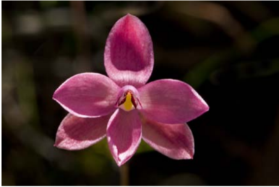
Crimson Sun Orchid

Mt. Beckworth is highly regarded as a significant orchid site with a wide range of species – over fifty have been recorded. Several of these occur in large numbers. Many can be found growing on the eastern side of the mount on the well-drained granitic outwash sands below the granite tors. Most of the orchids flower from September to November but a few, such as some of the Greenhoods, are autumn and winter-flowering.