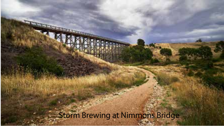
Storm Brewing at Nimmons Bridge