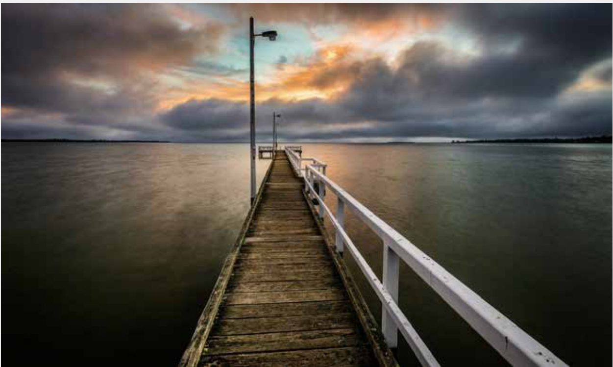
Paynesville Pier 2