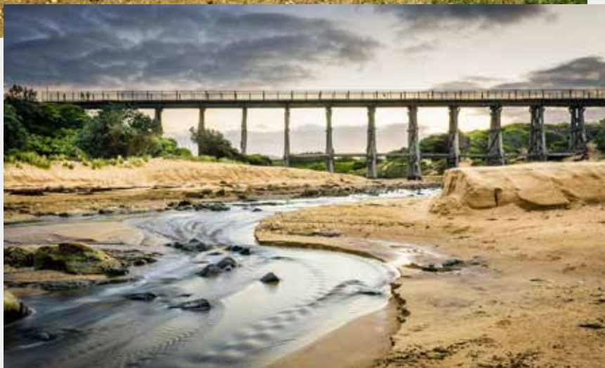
Water Under the Bridge