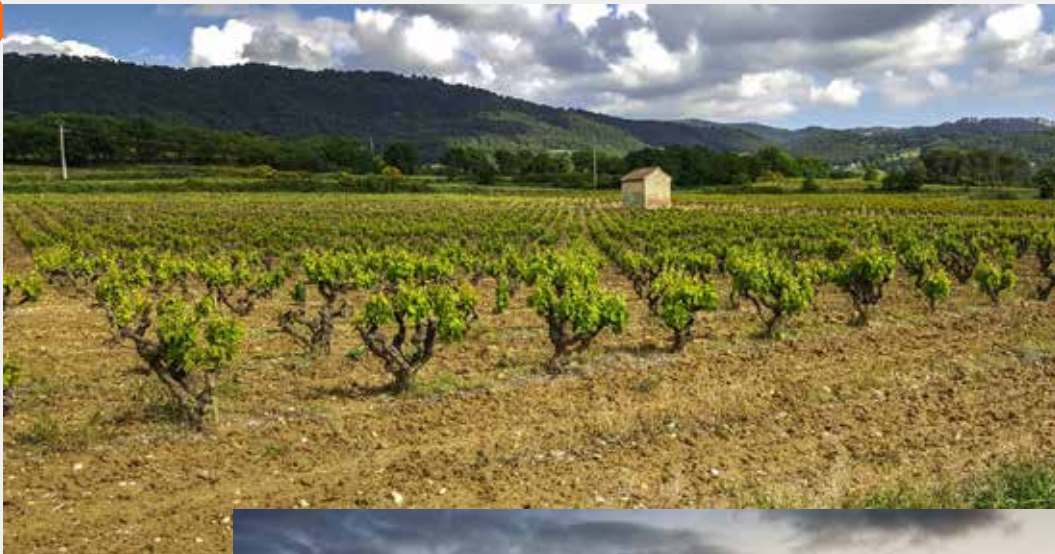
Vineyard in the Valley