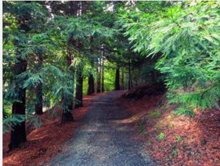
On the Gong Gong Track