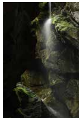
Haast Rd Falls