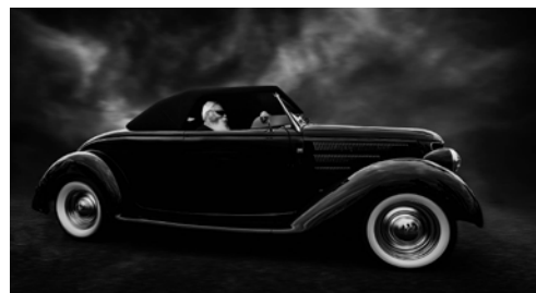
100 mph by Steve Demey

Bring your zoom lens for some great opportunities for bird photography.