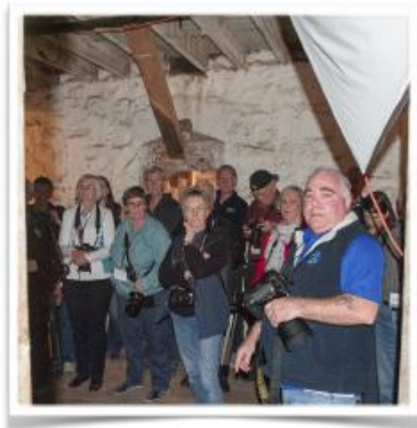
Andersons Mill Workshop