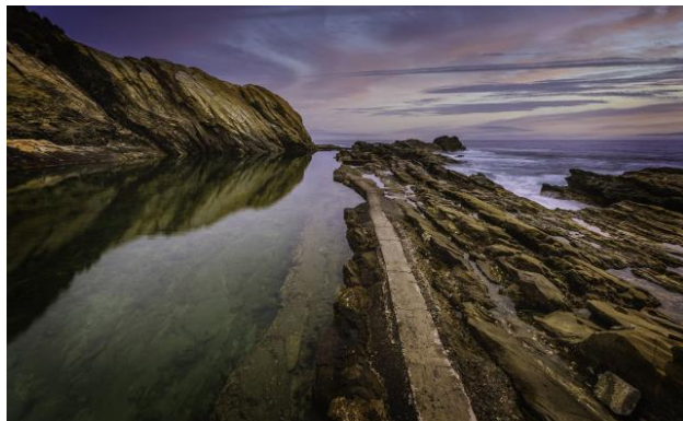
The Tidal Pool – Steve Demeye