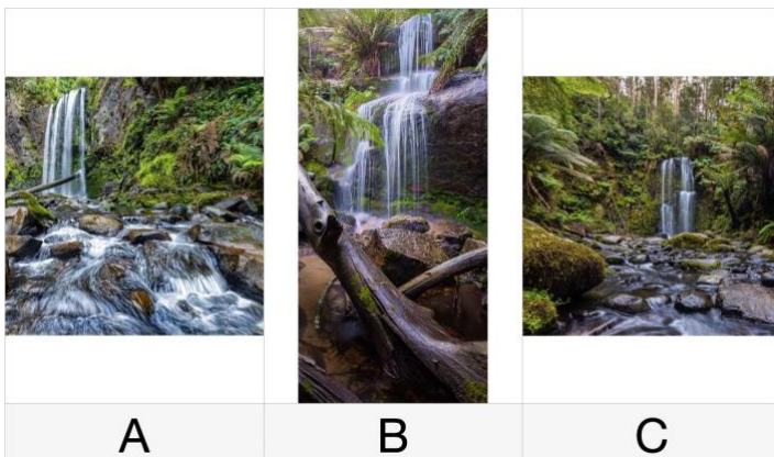
Waterfalls – Frank Carroll