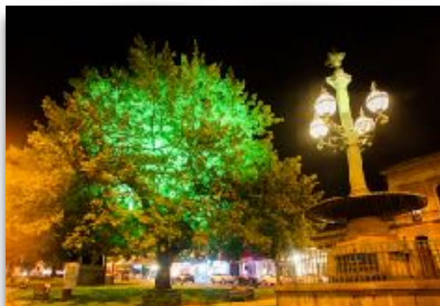
Sturt St Lights - Brett Keating