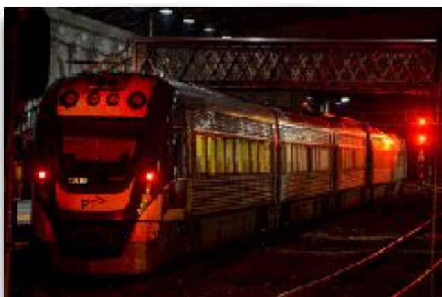
Train in Station Ballarat - Greg Tate